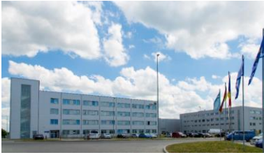
Balti, Republic of Moldova