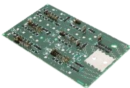
electronic power distributor