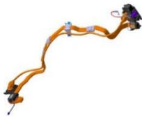
modular high-voltage charging system