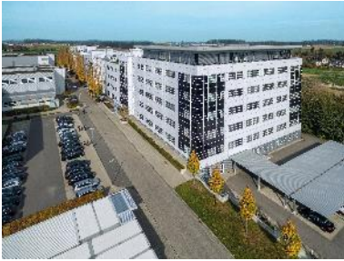
The headquarters in Vilsbiburg, Germany

https://www.draexlmaier.com/en/news/press/downloadcenter/sites