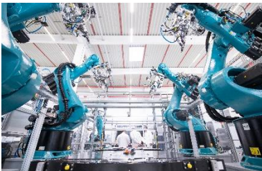
production battery systems

https://www.draexlmaier.com/en/news/press/downloadcenter/production-logistics