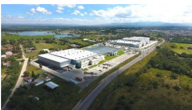
Lagos de Moreno, Mexico