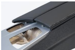
natural fiber reinforced center console