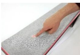
Seamless Touch under soft surfaces

More information about the products and solutions: