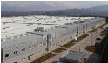
Kavadarci, North Macedonia